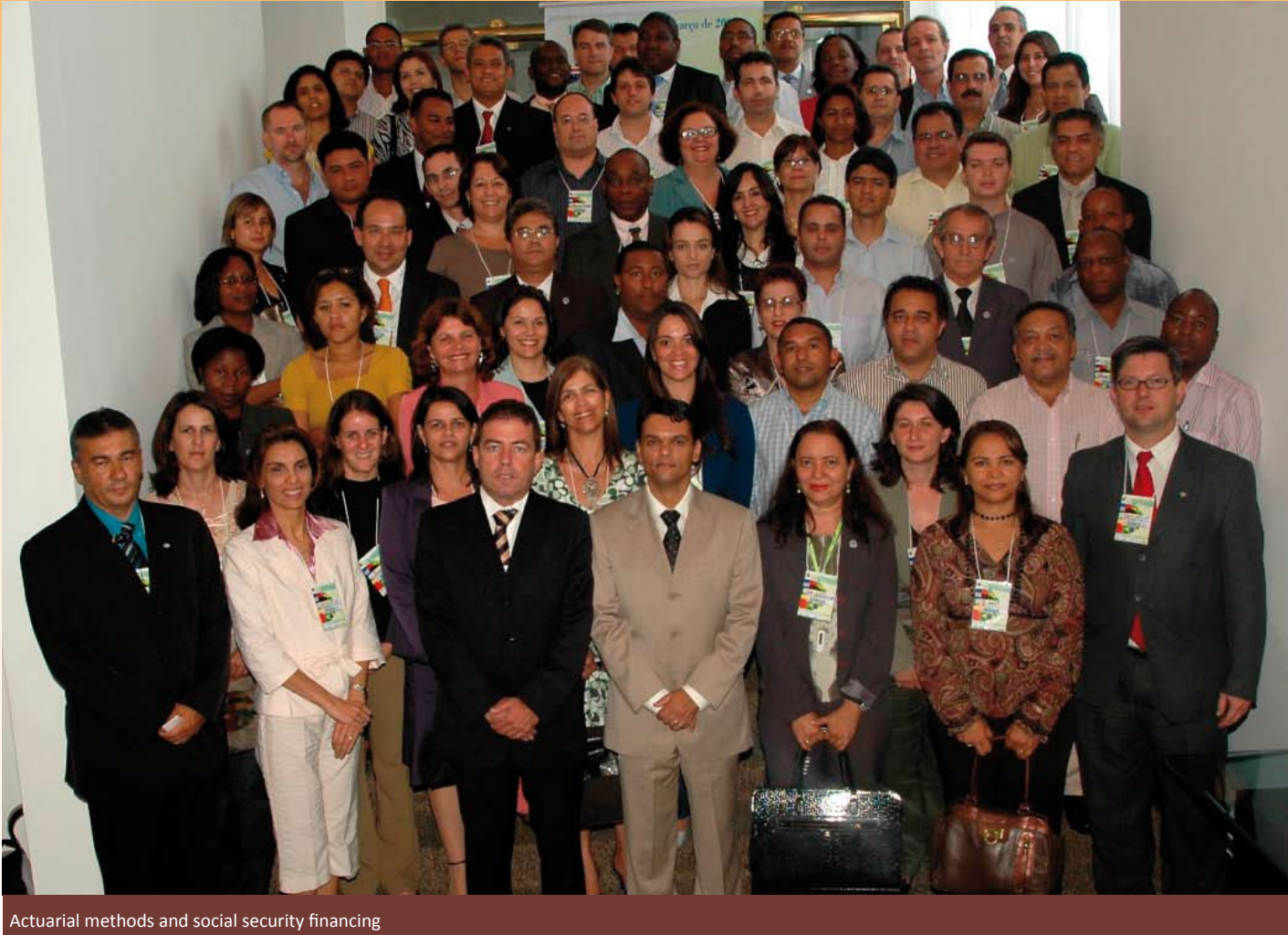
Actuarial methods and social security financing Recife, Pernambuco, 25 to 28 March 2008

liminary list of 20 measures that can be considered good practice for improving contribution collection systems. The discussion will continue through the virtual platform.